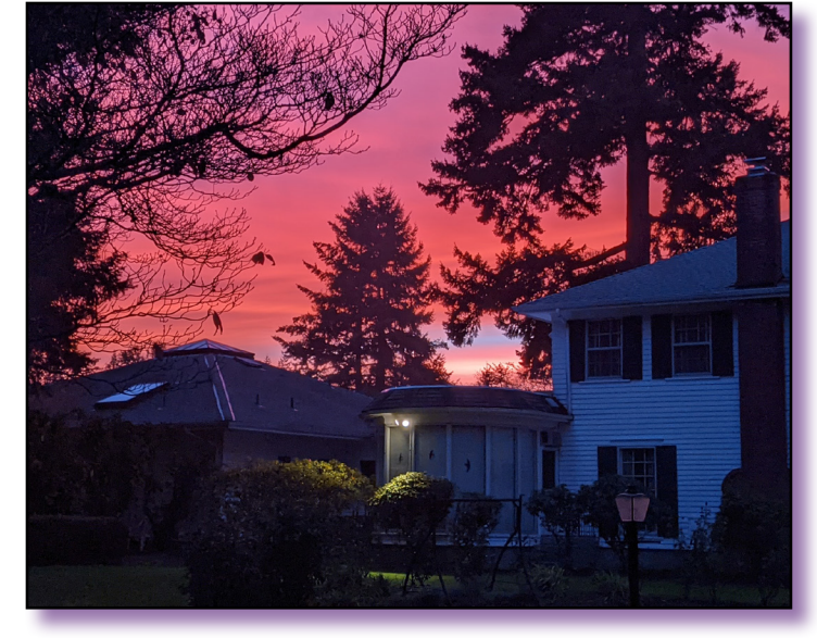
Sunset at the BSRC